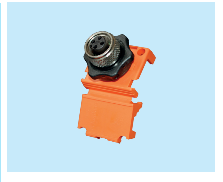
Active measuring point ASiMA

Protective system: IP67 Casing: PA Rated voltage at 40 °C: 4 A