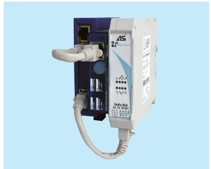
ASi-INSpektor® with Webinterface (StarterKIT)