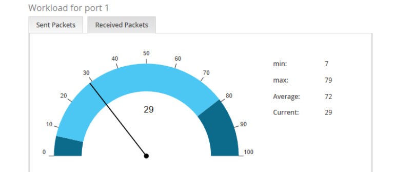
Display of netload with millisecond accuracy