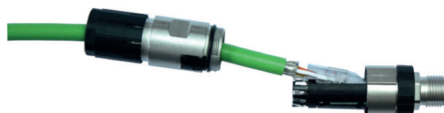
Sample application (side view)