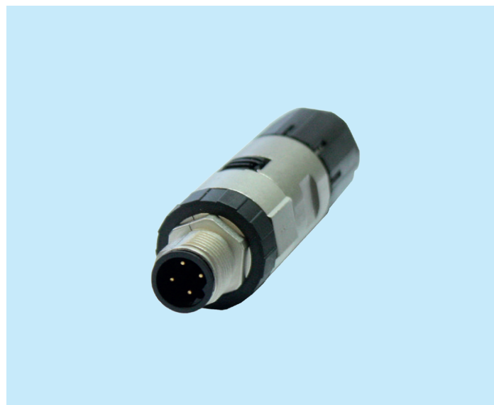
Circular connector IE Fast Connect Plug PRO M12 (D-coded)