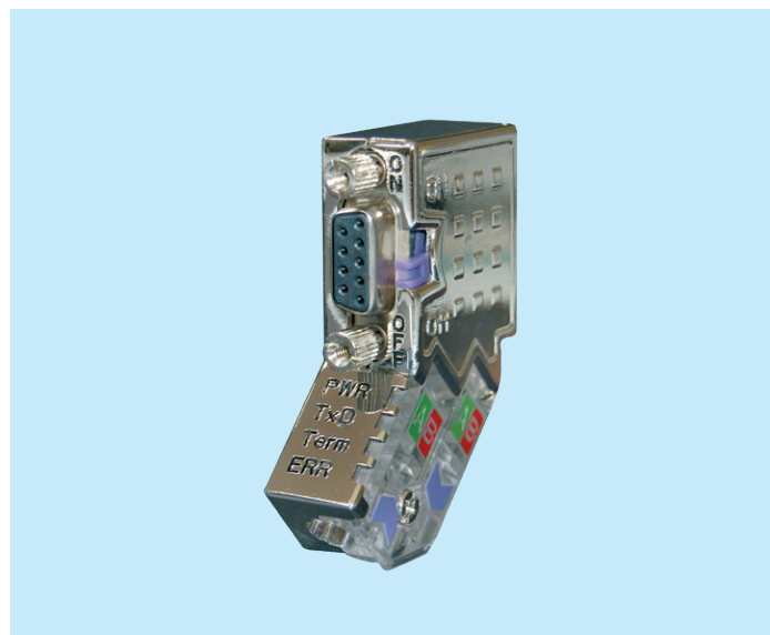
Diagnostic connector PG/45° Fast Connect

ON: • OFF: flashing (5Hz): extraneous: x