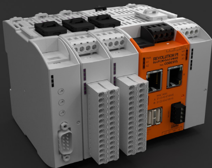
Easy connection of expansion modules via plug-and-play

The RevPi Connect+ feat. CODESYS can be used as a powerful, industrial small controller for a variety of different automation tasks and represents a real alternative to complex and cost-intensive PLCs.