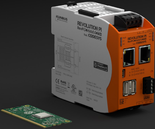
Equipped with the Raspberry Pi Compute Module 3+