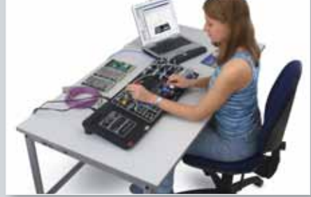
Compatible with hydraulics system: UniTrain-I Pneumatics/Electro-pneumatics