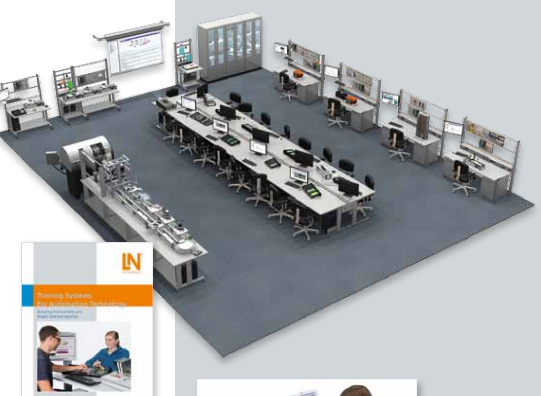
Additional information can be found in our automation catalogue

Siemensstraße 2 · D-50170 Kerpen-Sindorf Tel.: +49 2273 567-0 · Fax: +49 2273 567-39 www.lucas-nuelle.com