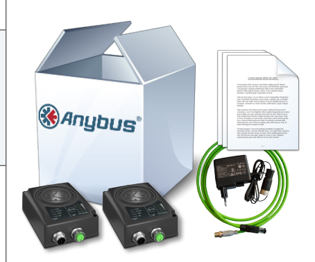
Order a Starter Kit!

Configuration You can configure the Anybus Wireless Bridge by accessing the built-in web pages in the product. You can also use the push-button. Pressing sequences will configure the product. Instructions included.