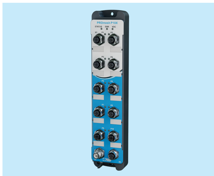
PROFINET Switch PROmesh P10X