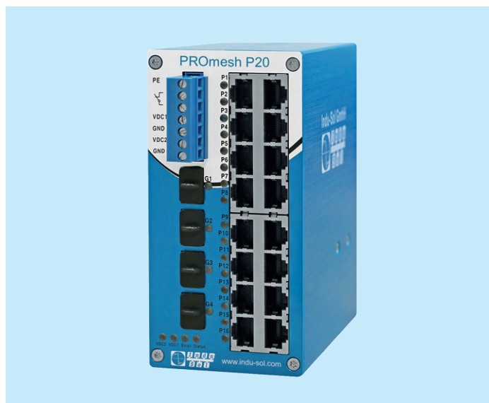
PROFINET Switch PROmesh P20